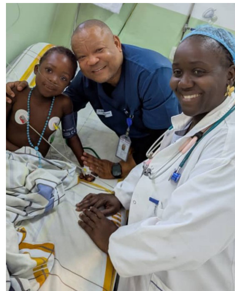
Child care at Heal Africa Hospital

African countries and seek funding for basic equipment.