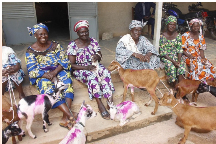
Widows celebrating gifts of goats