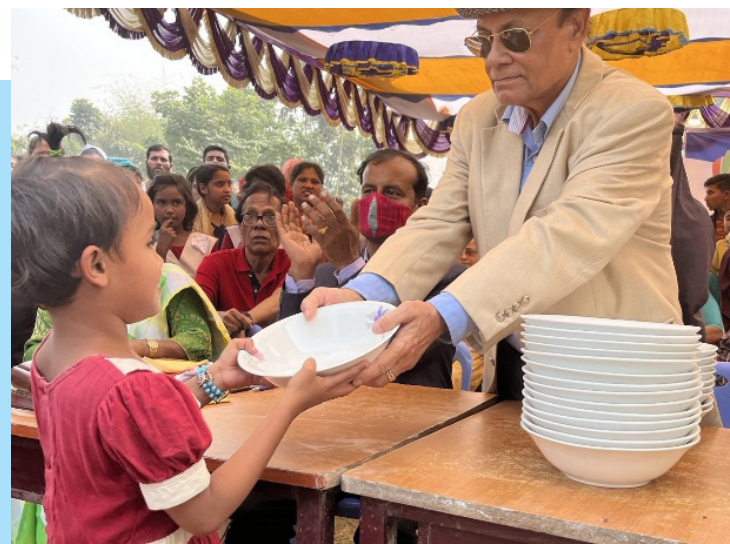
At our school for village children, a hot nutritious meal may be the only one they get each day