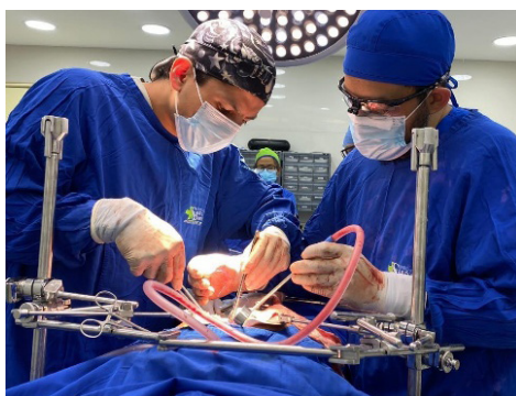
Medical and Surgical Clinics