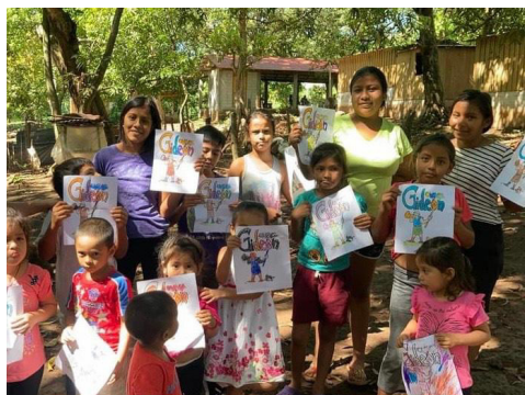
Supporting Education in poor villages