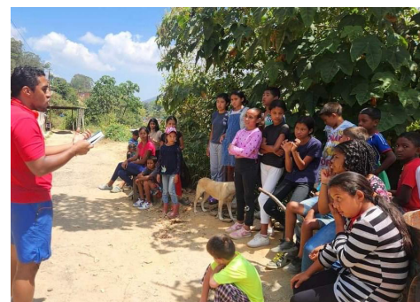
Gathering Malnutrition Data